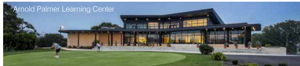
Arnold Palmer Learning Center

University of Pittsburgh, Graduate School of Public Health, Phase 2 LEED Gold