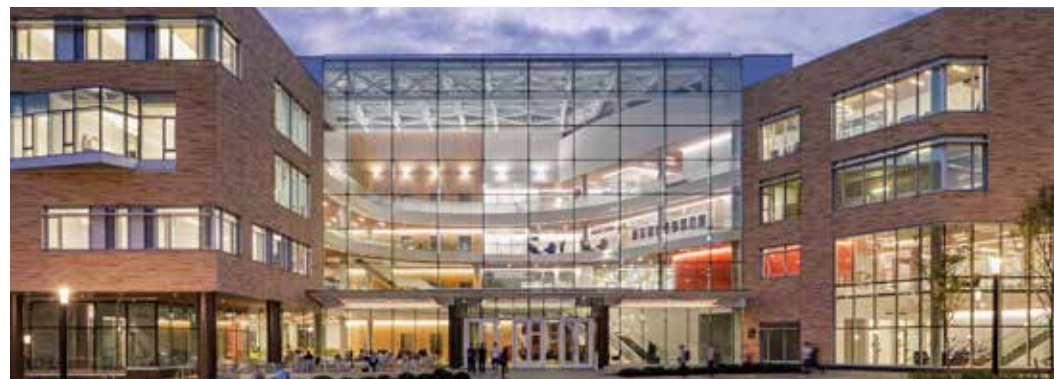
CMU Tepper Quad