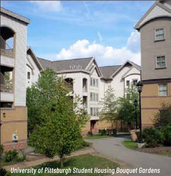
University of Pittsburgh Student Housing Bouquet Gardens

We see an intrinsic relationship between design and process, where your project's unique considerations and challenges have a profound role in guiding our decision making. Our approach is structured in a way to explore design opportunities both innovative and cost-effectively.