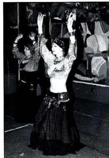
Students perform Gypsy dance

The annual event is a favorite on campus. "This is my third year here at State and I have been to each festival," bragged one student. "It gives us an opportunity to explore different foods that we normally wouldn't eat," claimed a student while enjoying an Asian food selection.