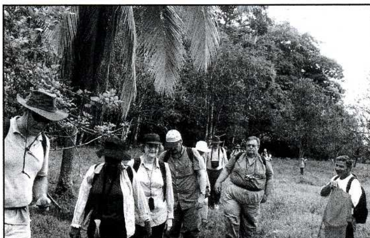
West Virginia educators hike along Costa Rican trails